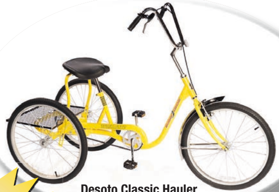
Desoto Classic Hauler